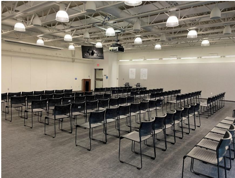
Image Description: Inside Arch Room 104, set up with black, portable chairs arranged in rows facing a lecture podium.