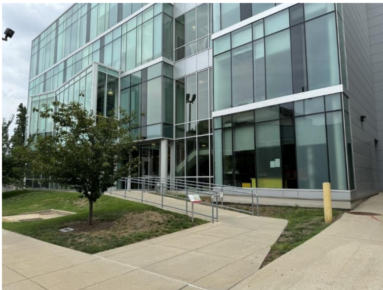
Image Description: The 13 th Street entrance to Tyler, a building with glass windows. It features an outdoor setting with a clear view of the sky and some plants around the building; there is a cement ramp leading up to the building entrance.

The 13 th Street entrance to Tyler is at 2001 N 13 th Street (between Norris & Diamond Streets). Access via ramp on the right side, once at the door there is an access button to press that opens both the inside and outside doors. This entrance is closest to the event space inside the building and is ideal for guests who prefer a shorter route to the event space.