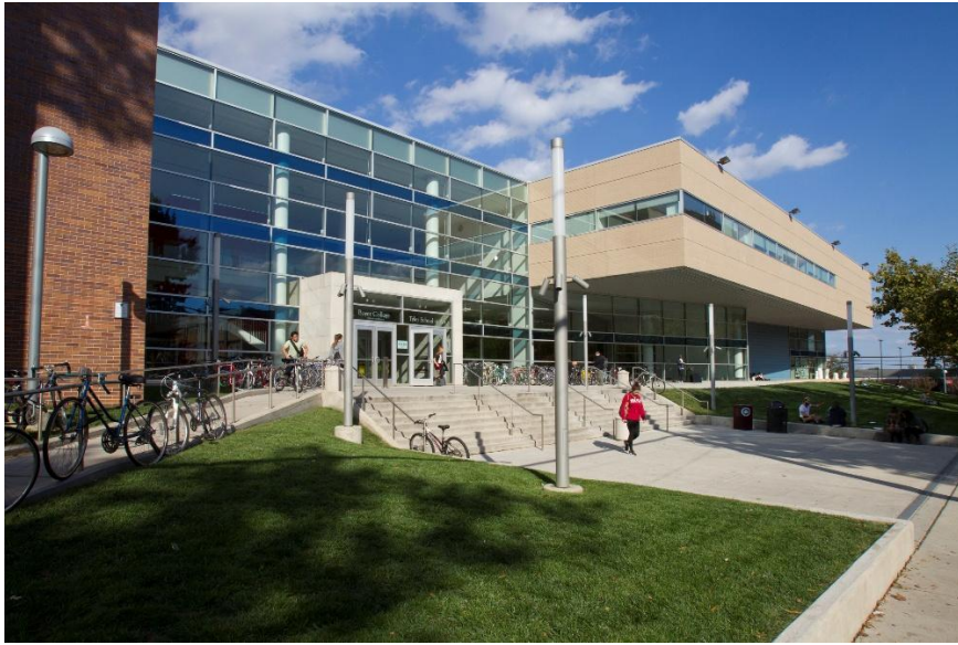
Image Description: The Norris Street entrance to Tyler, a building with glass windows. There is a cement ramp leading up to the building entrance on the left side and cement stairs.